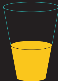
Extracted Energy 100% of all there is

Absolutely NOTHING!! Once ALL the available orange juice (real-time energy) is GONE, that's it!!